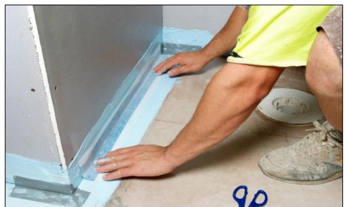
Installing Elastoproof B50 Bond Breaker Joint Band